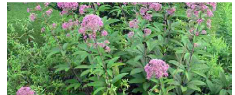
Little Joe Pye Weed ( Eupatorium dubium )