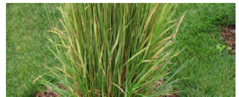
Small-reed or Reedgrass ( Calamagrostis)

For more information, frequently asked questions and price points, go to www.pwdraincheck.org