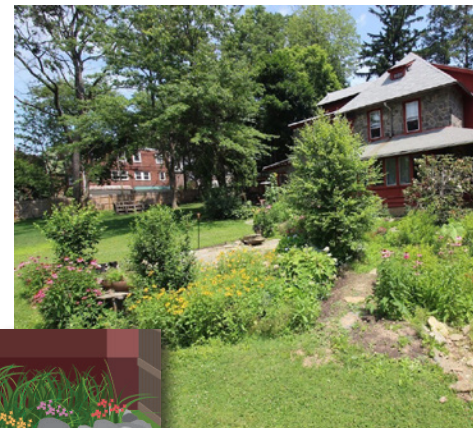
This shallow, planted depression absorbs the water that flows from a roof or patio.