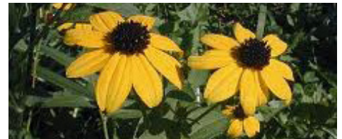
Brown-Eyed Susan ( Rudbeckia triloba )

For a more complete list of sample rain garden plants, visit: http://raingardenalliance.org/planting/plantlist