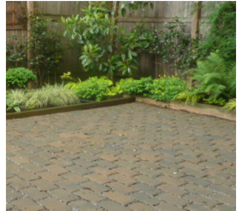
Permeable Pavers: Specially designed paving stones, bricks, or pavers that allow water to soak into the ground below.